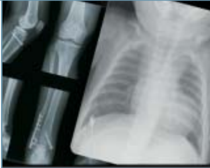
High-resolution of 508 ppi