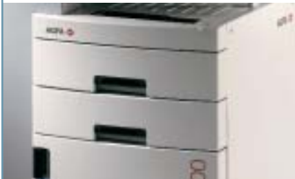
Two media trays for two on-line media sizes