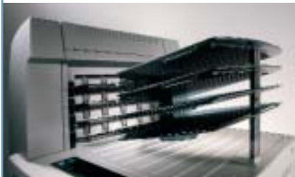
Unique sorter eliminates high-traffic bottlenecks